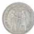
A rare N.Z. 1935 Waitangi Crown. Achieved $5,500