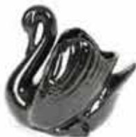
Rare Crown Lynn medium size black glaze swan vase. Achieved $950