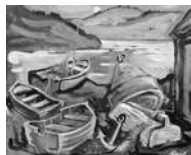
719 W.J.Reed oil painting