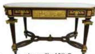
A quality 19thC French walnut and ormolu bureau plat. Achieved $14,000