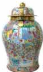
A large and impressive early 19thC Chinese famille rose lidded jar. Achieved $7,250