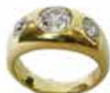
An 18ct. gold and diamond ring. Achieved $6,500