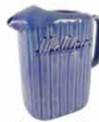
An uncommon Crown Lynn dark blue McAlpine refrigerator jug. Achieved $3,050