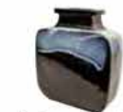
An impressive large Len Castle branch pot. Achieved $5,000