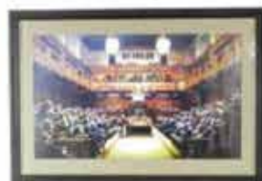
Banksy, 'Monkey Parliament', offset lithograph. Achieved $2800