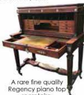
A rare fine quality Regency piano top secretaire. Achieved $2600