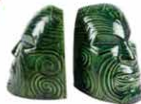
A pair of Crown Lynn Whareana Maori Art 'Moko' book-ends. Achieved $3,500