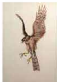
Raymond Ching, 'Eurasian Sparrow Hawk'. Achieved $4,750