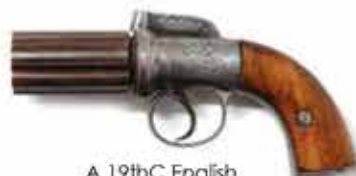
A 19thC English pepper pot pistol. Achieved $1550