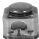
258 Moorcroft inkwell