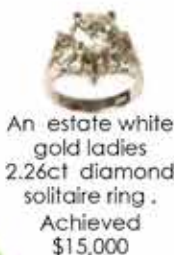
An estate white gold ladies 2.26ct diamond solitaire ring. Achieved $15,000