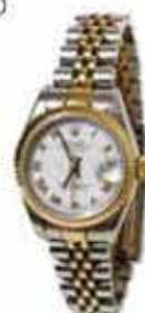
A Rolex bi-metal Date/Just lady's wristwatch. Achieved $2200