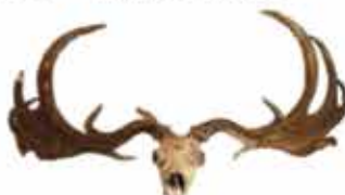
A set of extinct Irish elk horns and skull. Achieved $28,000