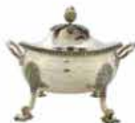
A rare and historically important George III lidded Scottish silver large tureen. Achieved $6,500