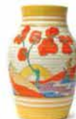
A Clarice Cliff large Isis vase. Achieved $2675