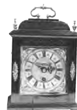
Lot 550 Sam Watson spring clock

A 15% percent buyers premium applies to this auction plus G.S.T. on premium = all up 17.25% Catalogue also online at www.cordys.co.nz .