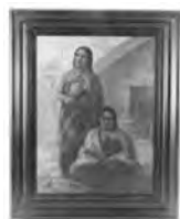
Lot 762 Adele Younghusband painting