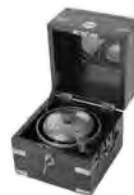
Lot 541 C. 1830 chronometer