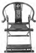
Lot 658 Pair huanghuali chairs