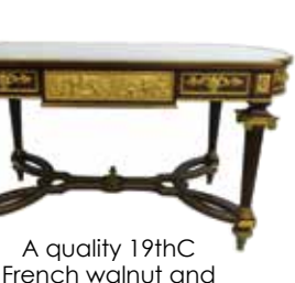
French walnut and ormolu bureau plat. Achieved $14,000